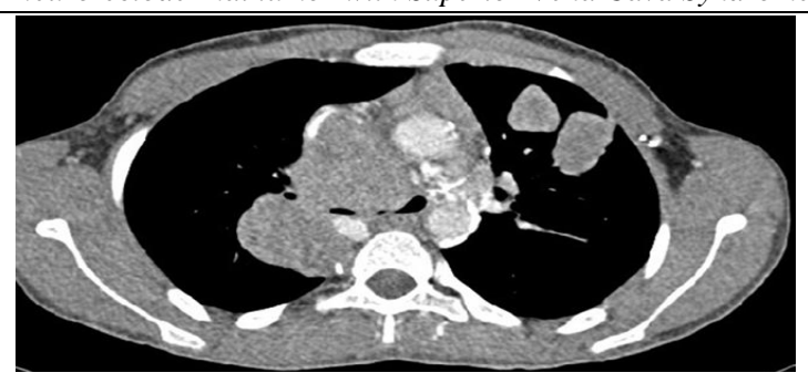
Figure 1. CECT image showing a lobulated mass involving the mediastinum and right paraspinal region and causing obliteration of Superior vena cava and right main bronchus. Dilated Azygos vein and metastatic nodules in left lung can also be seen.