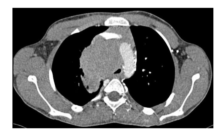
Figure 2: CECT image showing infiltration and complete obliteration of Superior Vena Cava by the mediastinal mass.